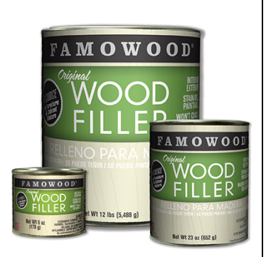
Net Wt 6 oz Net Wt 23 oz Net Wt 45 oz Gallon